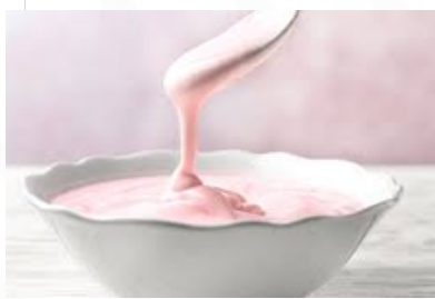
Image: Smooth yoghurt