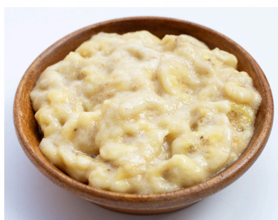
Image: Mashed banana