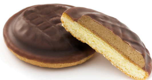
Image: Jaffa cake