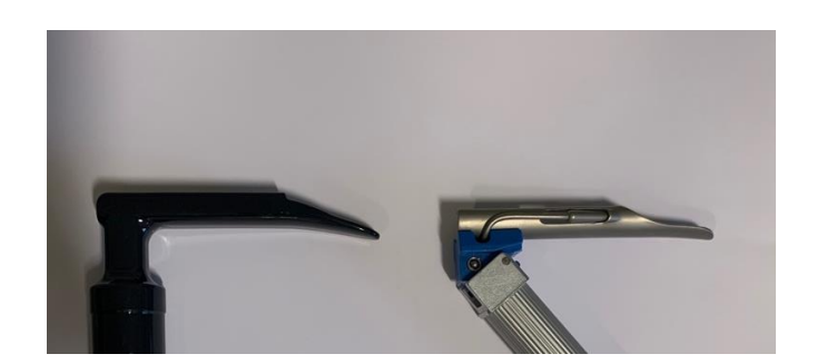
Figure 2: Comparison of blades (VL left, CL right)