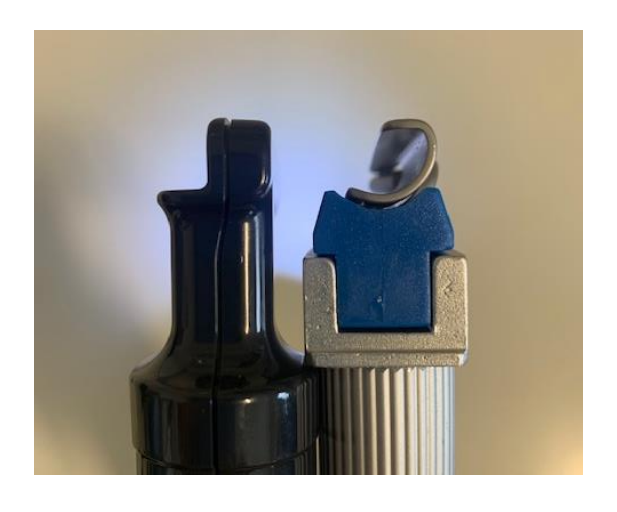
Figure 4: Comparison of blades (VL left, CL right)

This can result in a shorter and narrow view of the oropharynx on direct laryngoscopy, whilst the view on the screen is maintained. Asking an assistant to lift the infant's upper lip can expand the direct view.