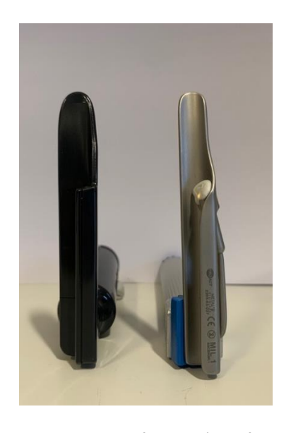
Figure 3: Comparison of blades (VL left, CL right)

There are some differences between the VL blades compared to conventional laryngoscope (CL) blades:<sup>2</sup>